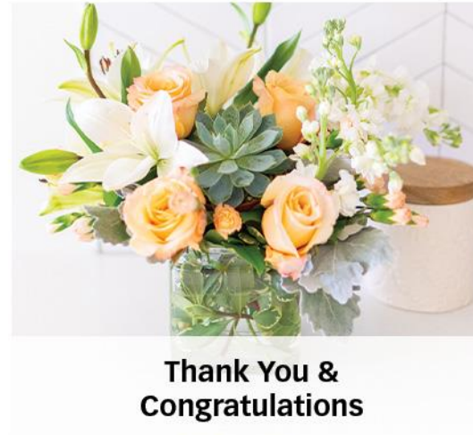
Thank You & Congratulations