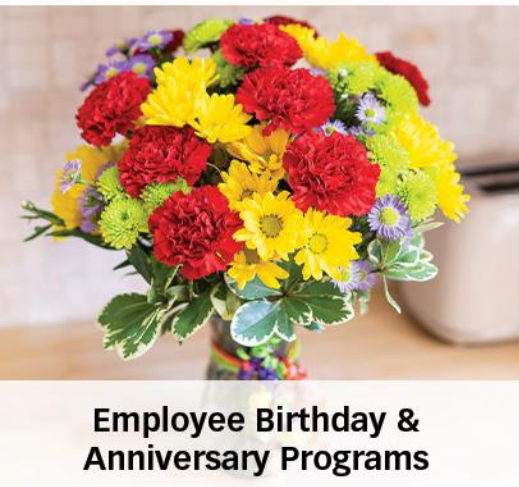
Employee Birthday & Anniversary Programs