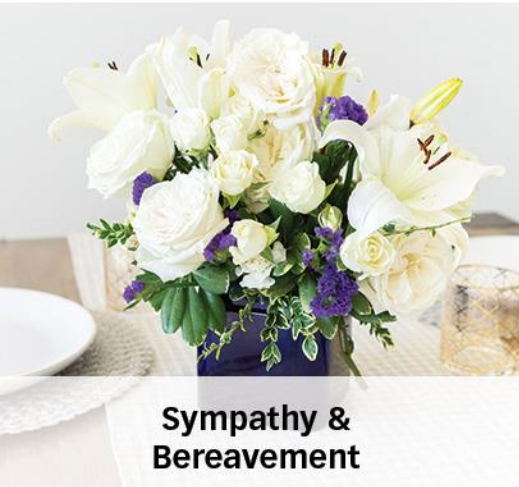
Sympathy & Bereavement