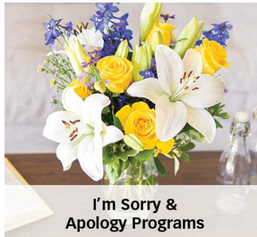
I'm Sorry & Apology Programs